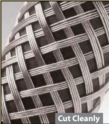
Cut Cleanly Shears